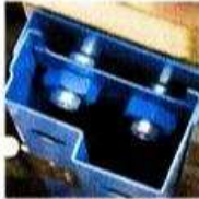
The adjust-2-fit expander frame fitting system.