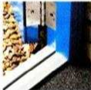
Low profile, DDA approved aluminium threshold with rubber sealing strip.