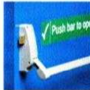
3785E Briton, single point panic bar.