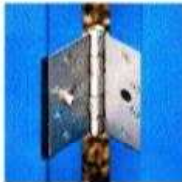
Grade 13 stainless steel hinges, complete with security dog bolts.